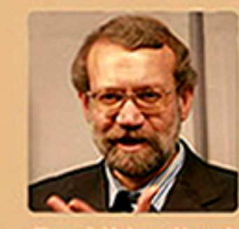
Dr. Ali Larijani