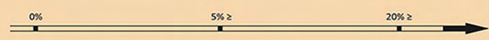
Level of Iran's Uranium Enrichment