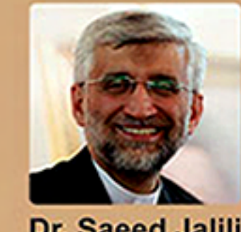
Dr. Saeed Jalili