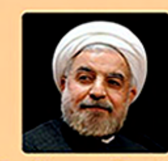
Dr. Hassan Rouhani