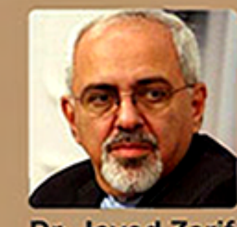
Dr. Javad Zarif